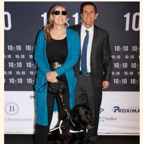
10X10 EVENT SUPPORTING DISABILITY & ACCESSIBILITY